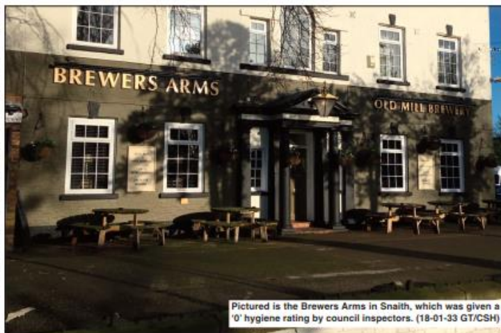
Pictured is the Brewers Arms in Snaith, which was given a '0' hygiene rating by council inspectors.

"Officers have revisited the premises since